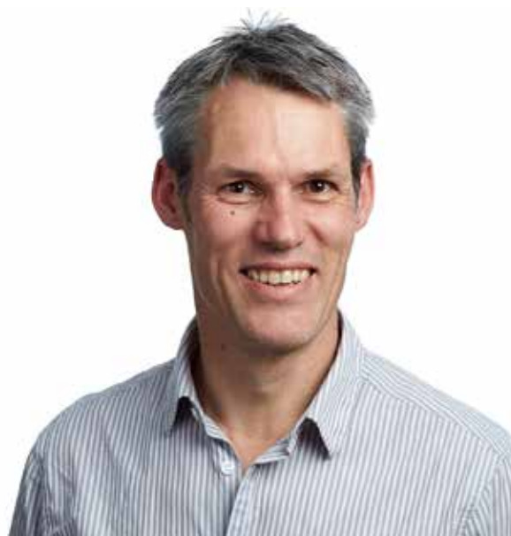
Professor Dr. Carlo Largiadér

The majority of the stored samples are serum and plasma samples. The Liquid Biobank Bern makes use of FluidX cryotubes of different sizes (270 ul, 525 ul or 1.8 ml) to store samples. The decision was based on the fact, that current analytical methods require relatively small sample volumes. In order to be cost-effective, the Liquid Biobank Bern focused on small-sized formats.