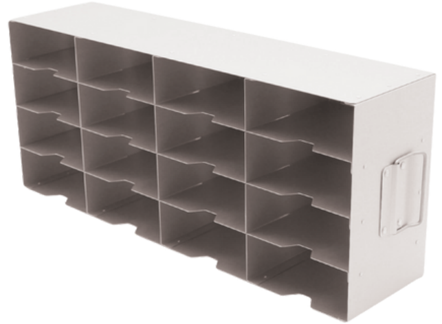
Side access rack to store 2" box SOR196