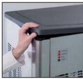
ABS plastic top cover